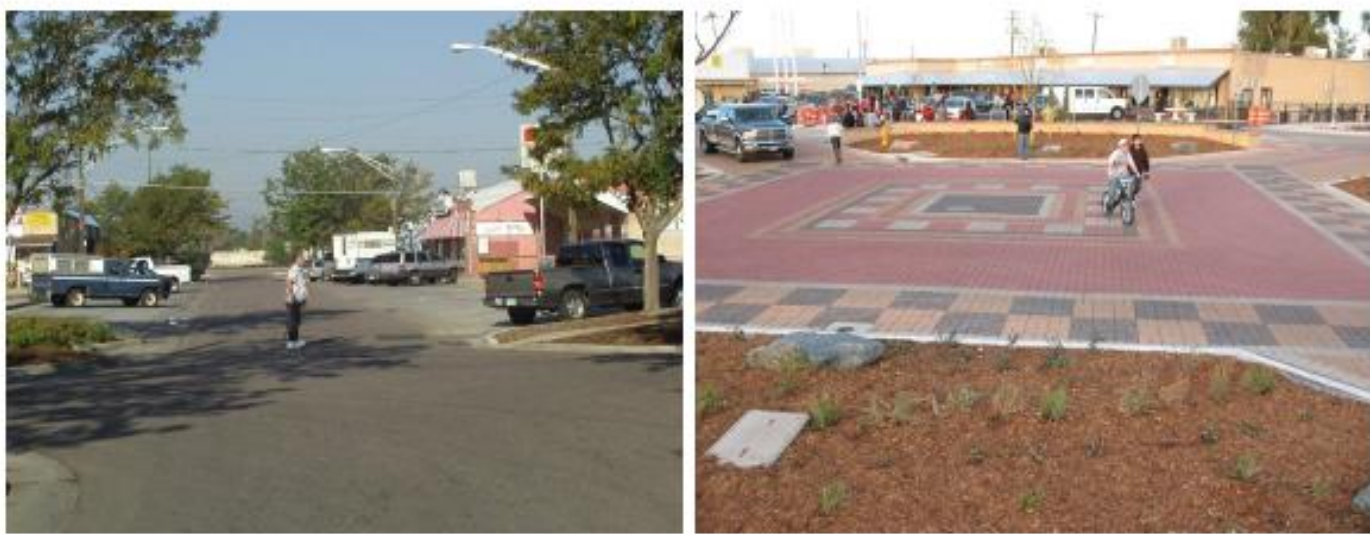
Traffic safety was a key theme of the community during the Derby Redevelopment effort. In the summer of 2010, the city constructed the $900,000 Derby Diamond, a template intersection with colored concrete, landscaping and other features to make the crossing safe for people waking or biking. Prioritizing funding to construct other traffic calming features throughout the city will make walking and biking inviting for people of all ages.