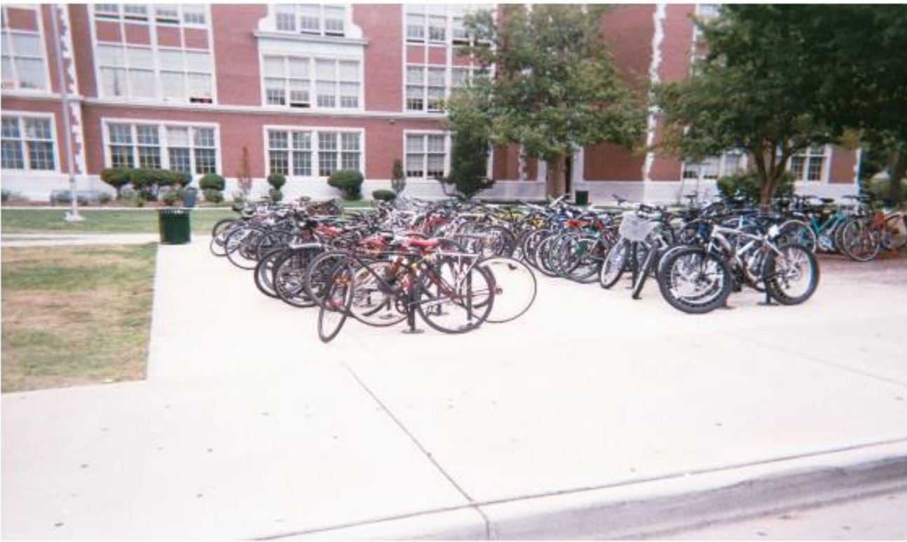
These bike racks were just scarce pieces of metal that sat through different types of weather. A year later, they sit alone no more and they don't even fit all the bikes that are now coming to the high school.

Kaiser Permanente (KP) supports partners and programs that teach, inspire, and encourage healthy communities for the people and by the people who live there. Through past community health initiatives, KP has invested in Photovoice projects in Colorado and California. These projects were traditional, community driven Photovoice sessions, which sought to identify ways KP could help improve the health of people in the communities we serve. Past evaluations of those community health initiatives and programs utilized Photovoice programs as a pre/post tool to demonstrate changes over time. Below are some examples of photos and accompanying quotes from community members highlighting changes after community advocacy efforts.