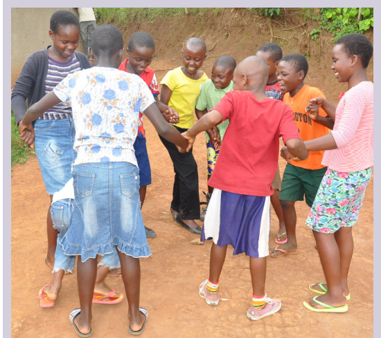
Girls and boys, ages 10-14, play interactive games designed specifically for VYAs.

IRH stands ready to assist the MOH and partners in implementation and evaluation of adolescent sexual and reproductive health strategies that move Rwanda's policies into action.