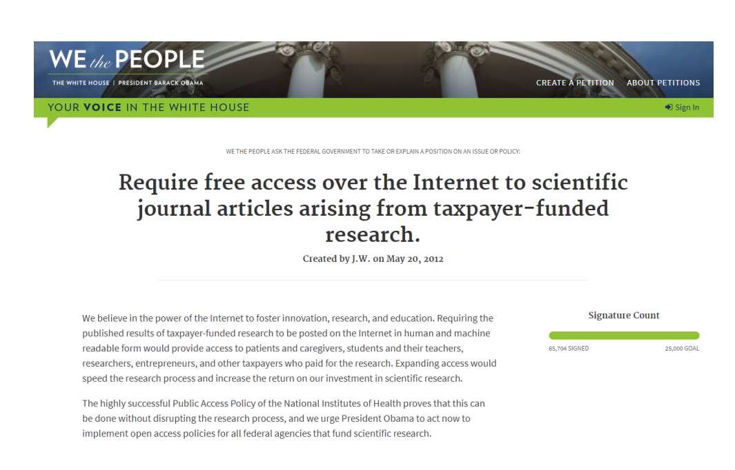
Figure 1. "We the People" petition to the White House requesting public access to taxpayer-funded research (2012)<sup>b</sup>

In 2013, the White House Office of Science and Technology Policy published a memorandum (commonly known as the "Holdren Memo") requiring large federal research agencies to develop policies intended to provide public access to federally-funded research. The memorandum applies to federal agencies with at least $100M in research spending per year.